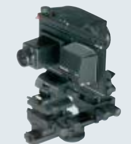
ULTIMA 35-TO-ULTIMA 23 CONVERSION KIT SHOWN WITH OPTIONAL MULTISTEP SLIDING BACK AND PHASE ONE H20 DIGITAL BACK.

This kit allows you to shoot with medium format digital backs, including Leaf, Kodak, Phase One and Imacon. Kit includes a 2 1/4 x 3 3/4" rear frame and a bag bellows. Requires a direct adapter for backs with live video focusing or a Multistep Sliding Back (listed below). UL-471