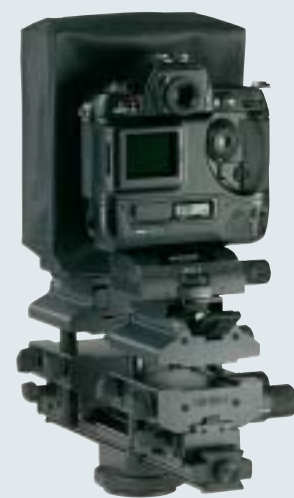
THE ULTIMA 35 WITH NIKON D1X

The Ultima 35 can be purchased in a variety of ways and packages. For those in the market for a complete digital camera solution, ask for a complete kit with the DSLR camera of your choice. For those that already own a DSLR camera, combine the appropriate kit with the second grouping. The Ultima 35 system of adapters and other DSLR-specific accessories will continue to be developed for future cameras that will be launched. Upgrading to a new DSLR will only require a new mounting block and vertical bracket, within the same bayonet system. All components are separately available.