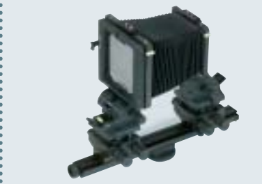
ULTIMA 35/23-TO-ULTIMA 4X5 CONVERSION KIT SHOWN MOUNTED.

Convert your Ultima 35 or Ultima 23 to a 4x5 film camera with this kit which includes a 4x5 rear frame, a 4x5 international ground glass back, a tapered bellows and a monorail extension. UL-470